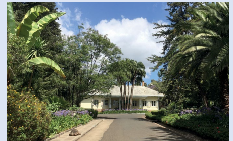
The festive award ceremony took place in the German Embassy in Ethiopia's capital Addis Ababa.