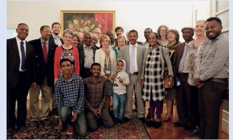
After the ceremony, there was an opportunity for discussions and networking with fellow countrymen from the administration and with international supporters from business and industry.